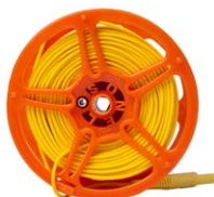
Test lead 50 m for earth resistance measurements (on a reel, banana plugs) yellow